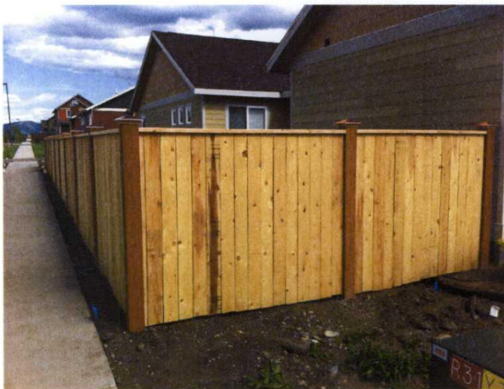
Figure 1 - Fence Example